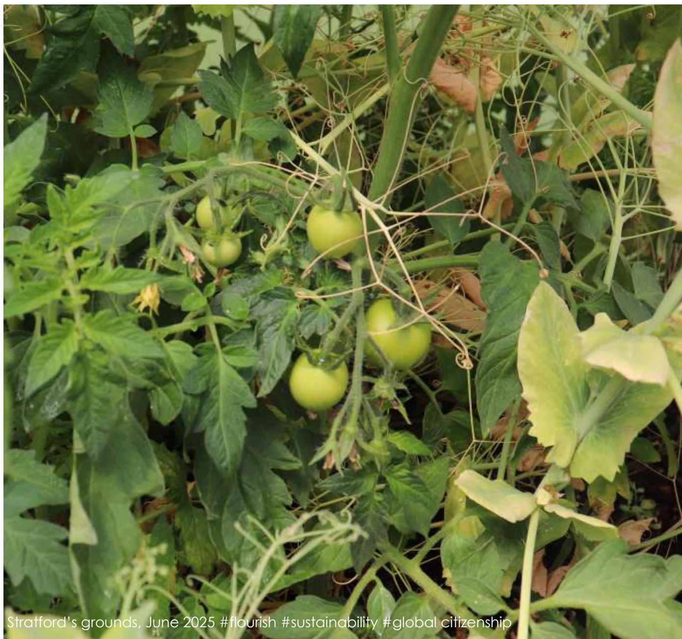
Stratford's grounds, June 2025 #flourish #sustainability #global citizenship