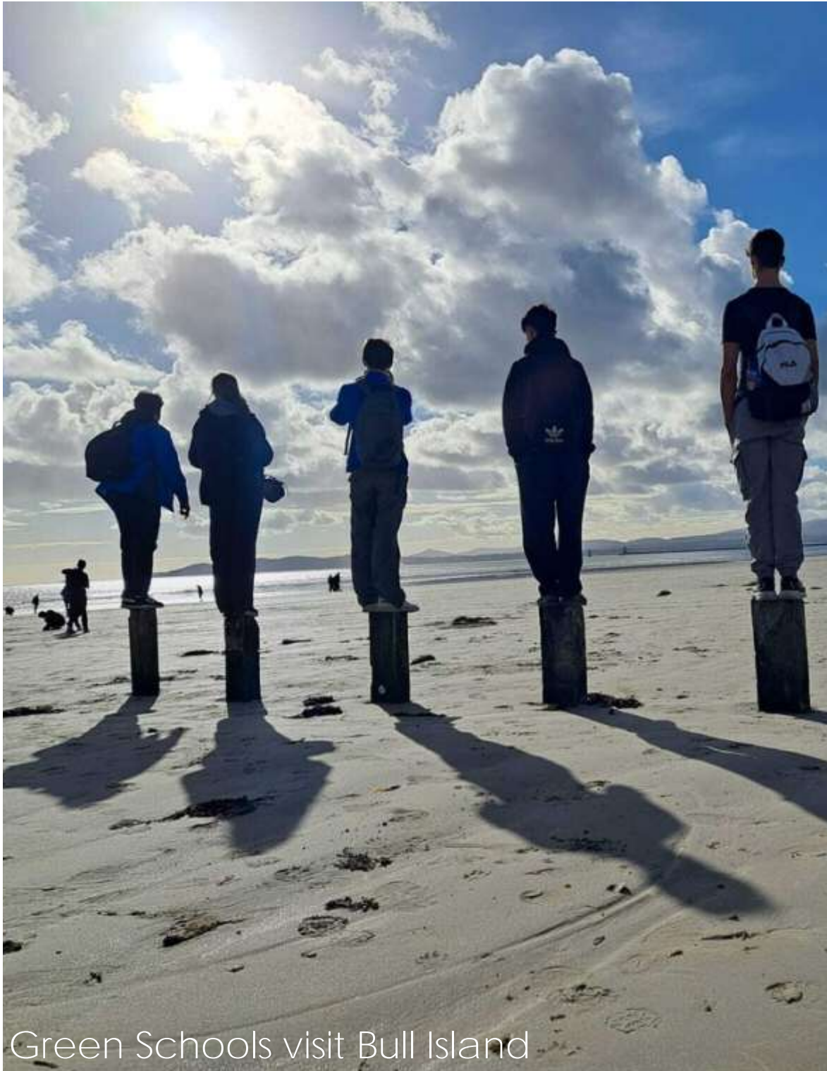
Green Schools visit Bull Island