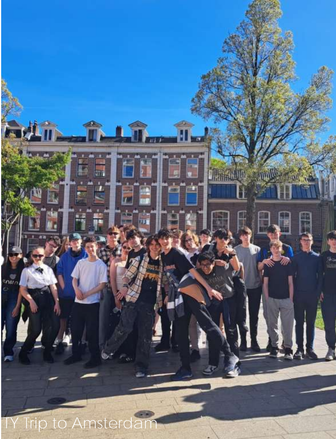
TY Trip to Amsterdam