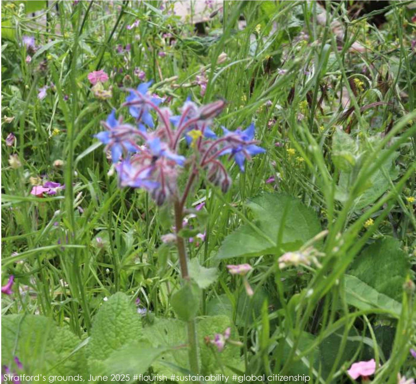
Stratford's grounds, June 2025 #flourish #sustainability #global citizenship