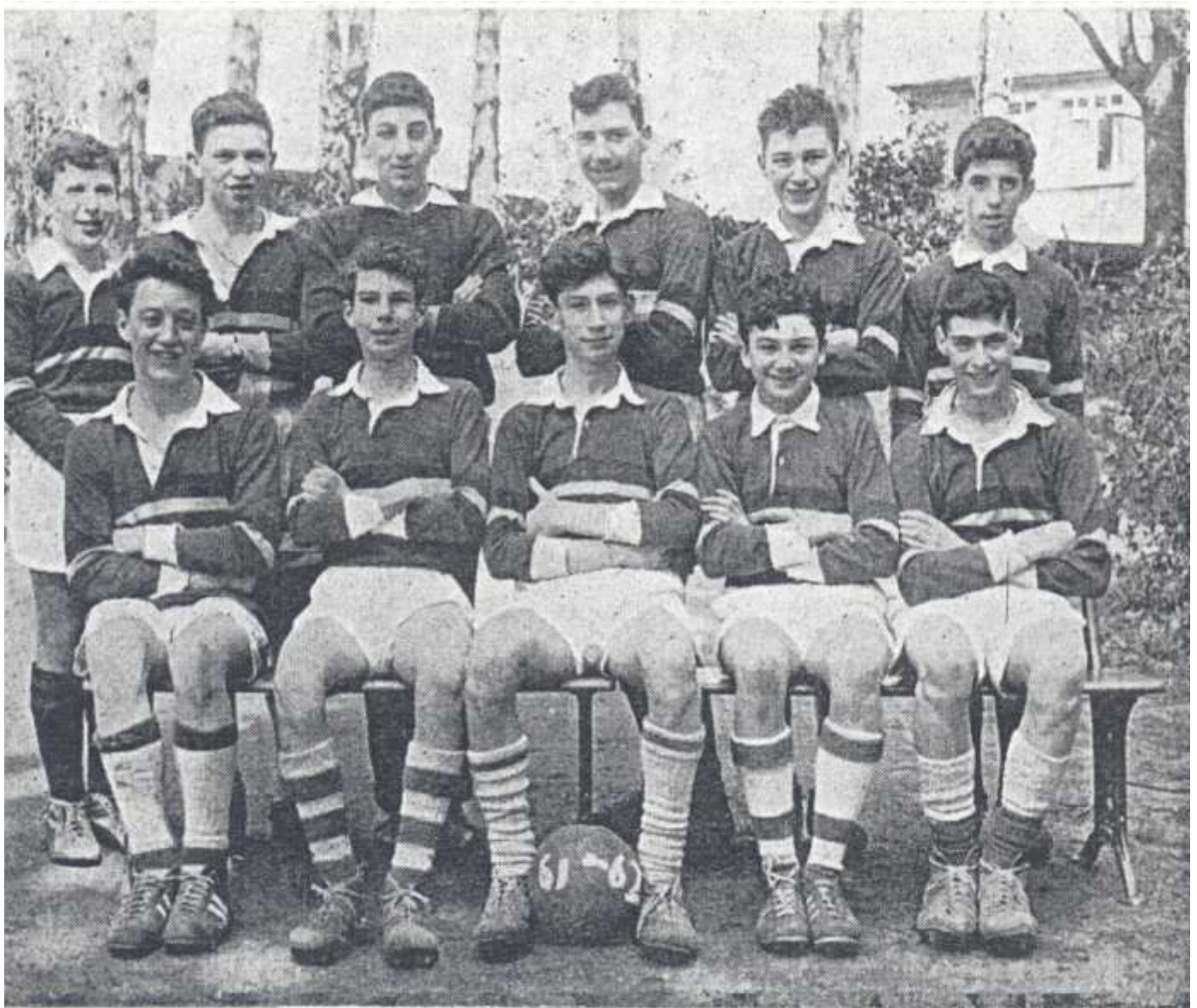
Boys' football team of 1961-1962