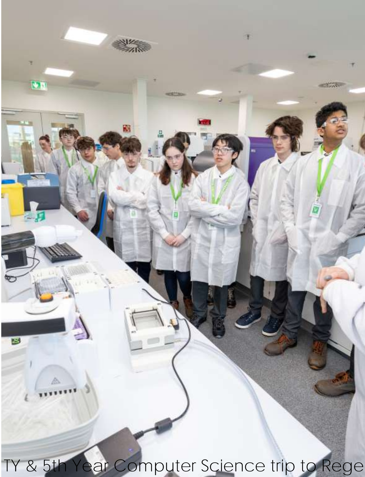
TY & 5th Year Computer Science trip to Regenoron