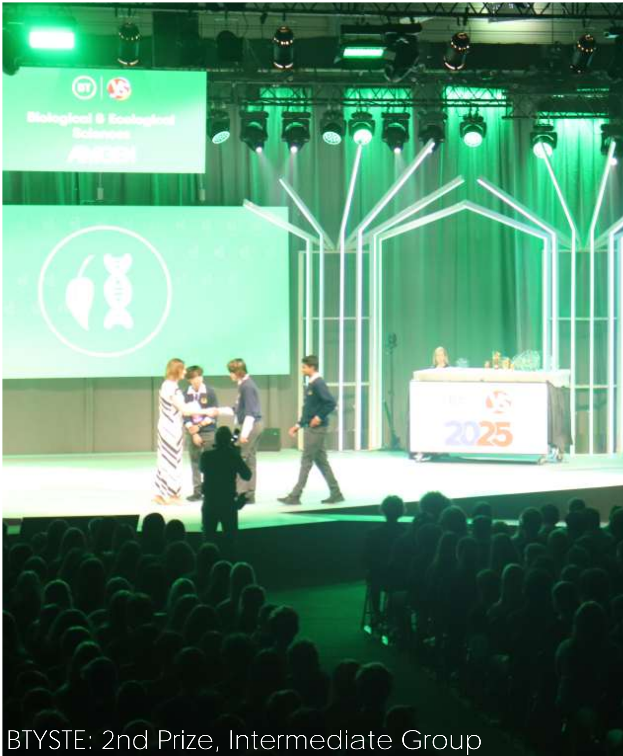
BTYSTE: 2nd Prize, Intermediate Group