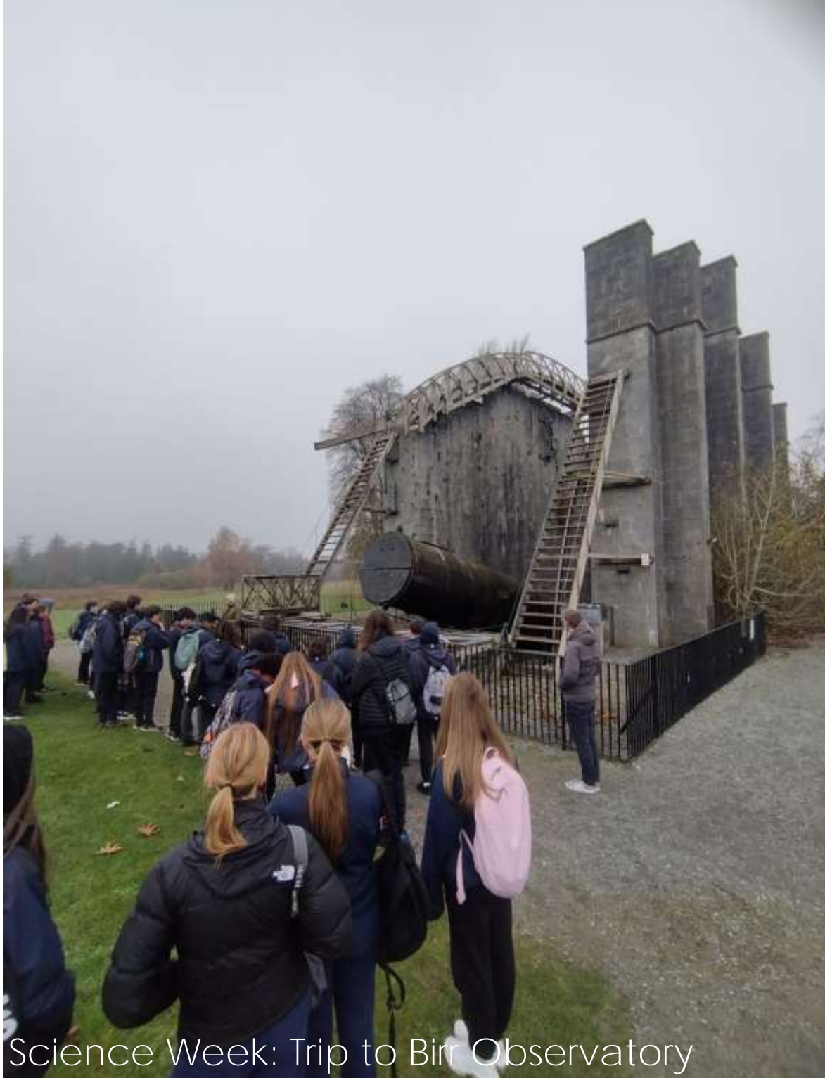
Science Week: Trip to Birr Observatory