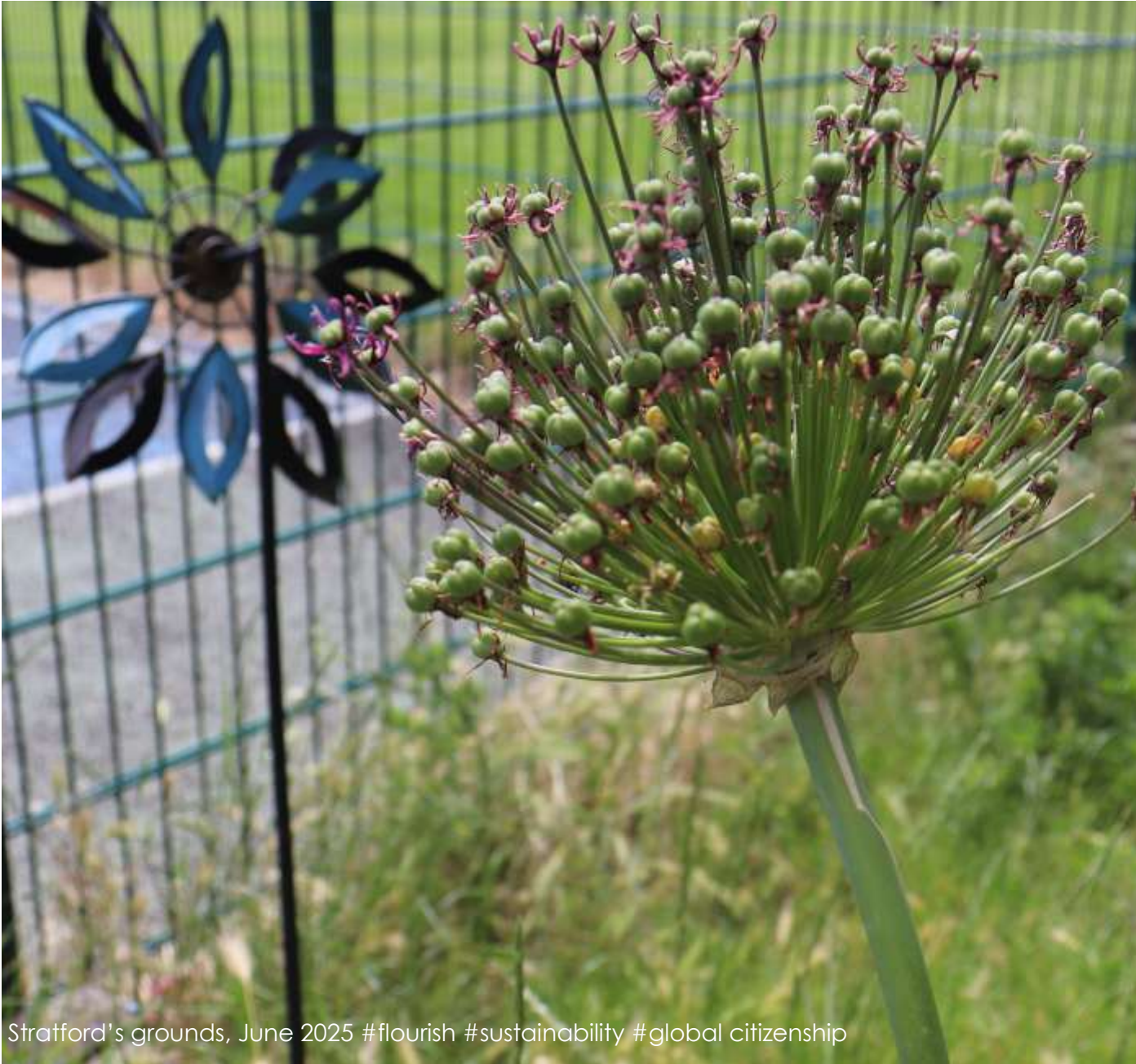
Stratford's grounds, June 2025 #flourish #sustainability #global citizenship