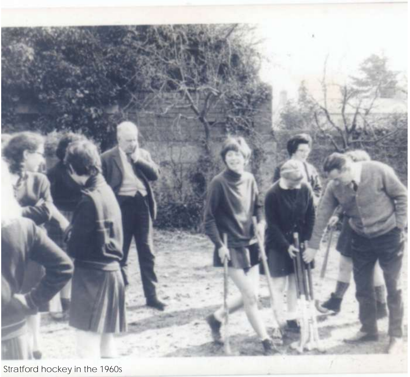
Stratford hockey in the 1960s