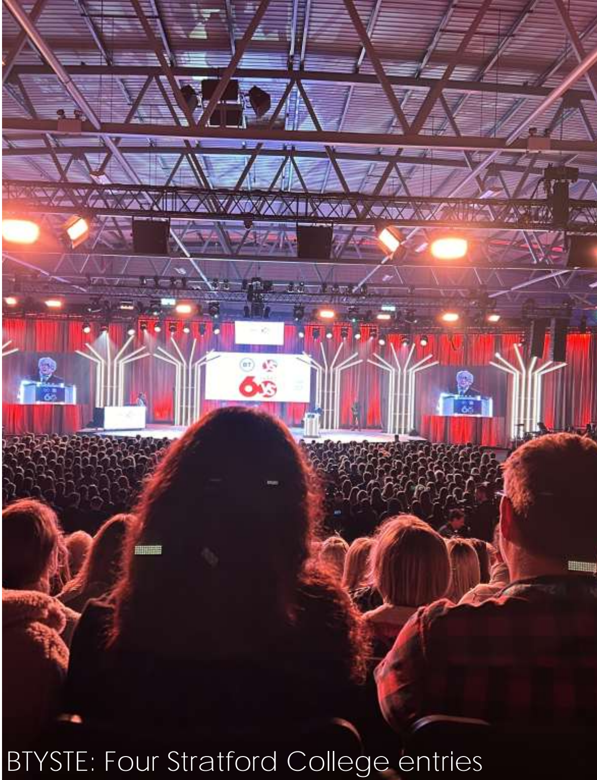
BTYSTE: Four Stratford College entries