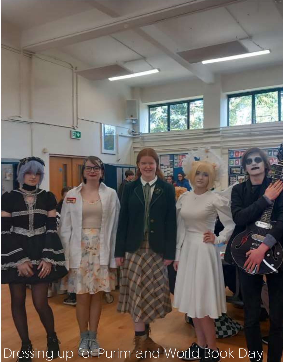
Dressing up for Purim and World Book Day