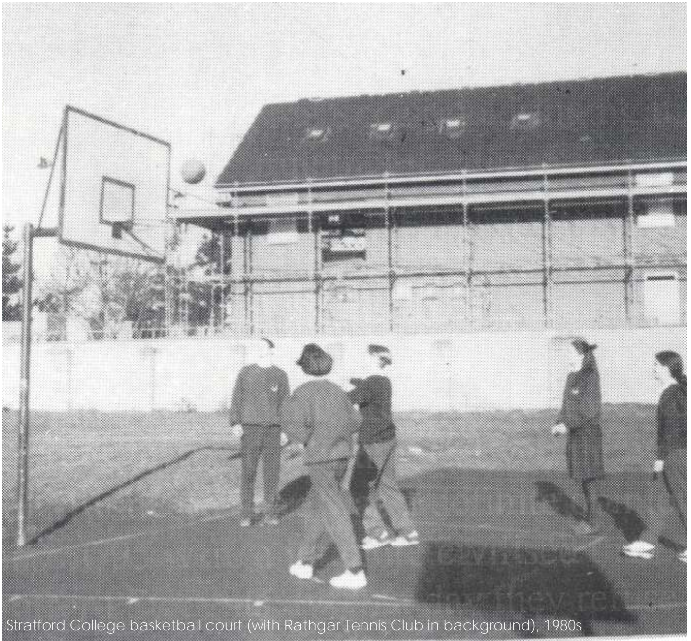
Stratford College basketball court (with Rathgar Tennis Club in background), 1980s