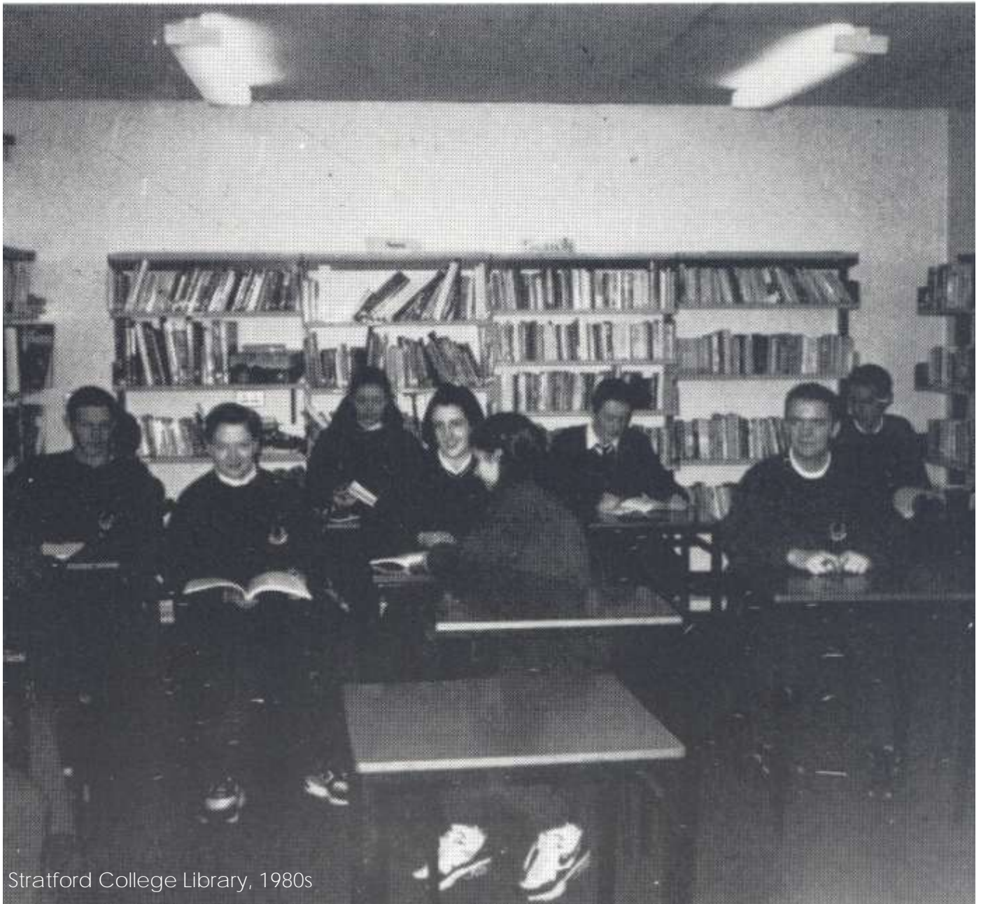
Stratford College Library, 1980s