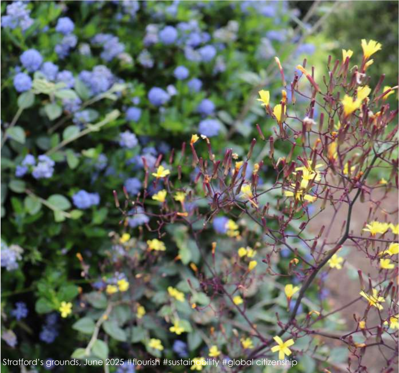
Stratford's grounds, June 2025 #flourish #sustainability #global citizenship