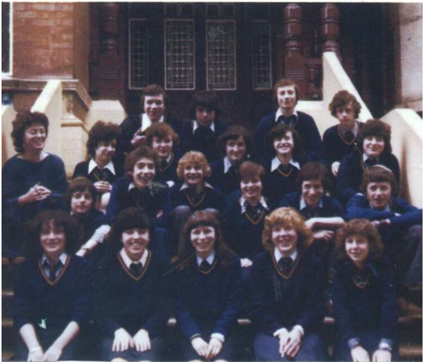
Class Photo Taken in 1978/1979