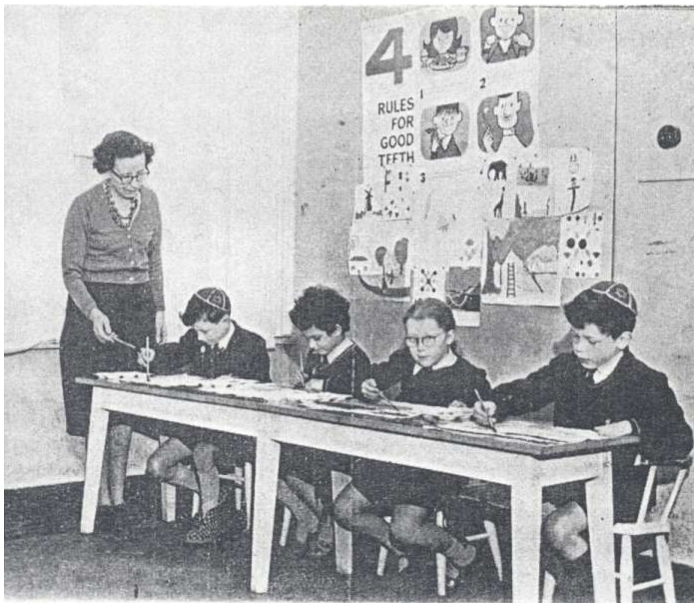
Children in the kindergarten hard at work 1961-1962