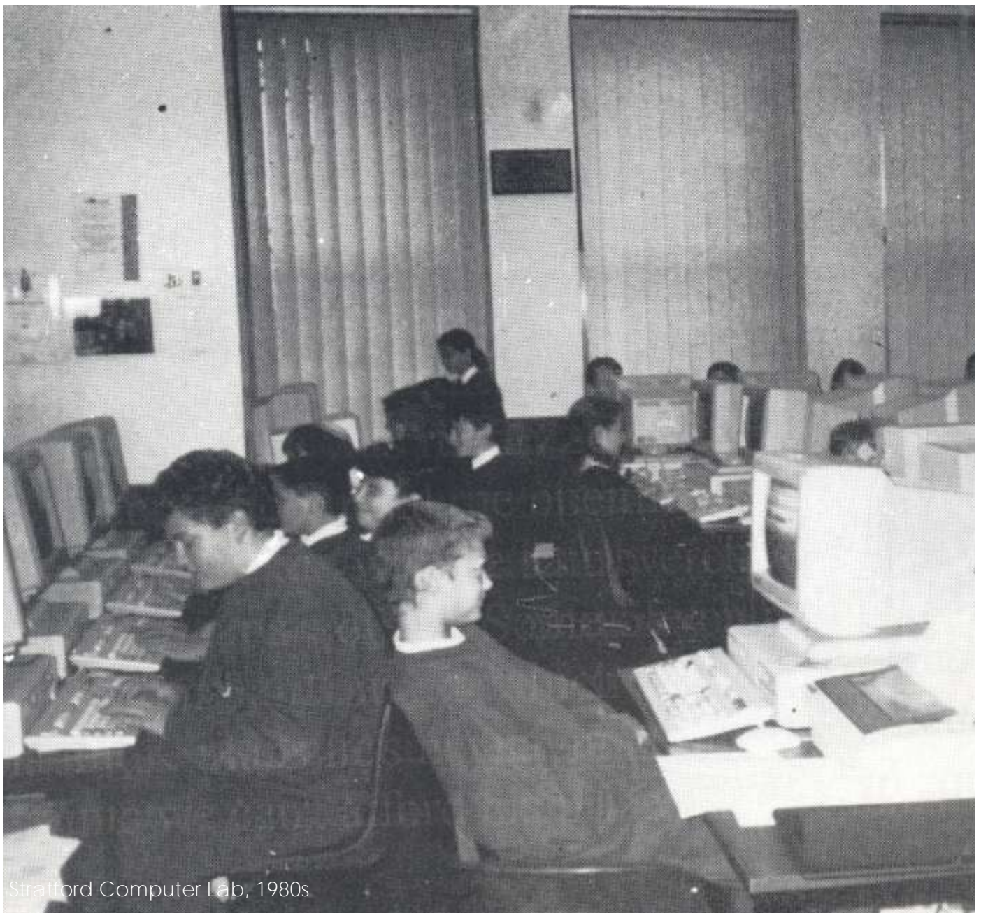
Stratford Computer Lab, 1980s