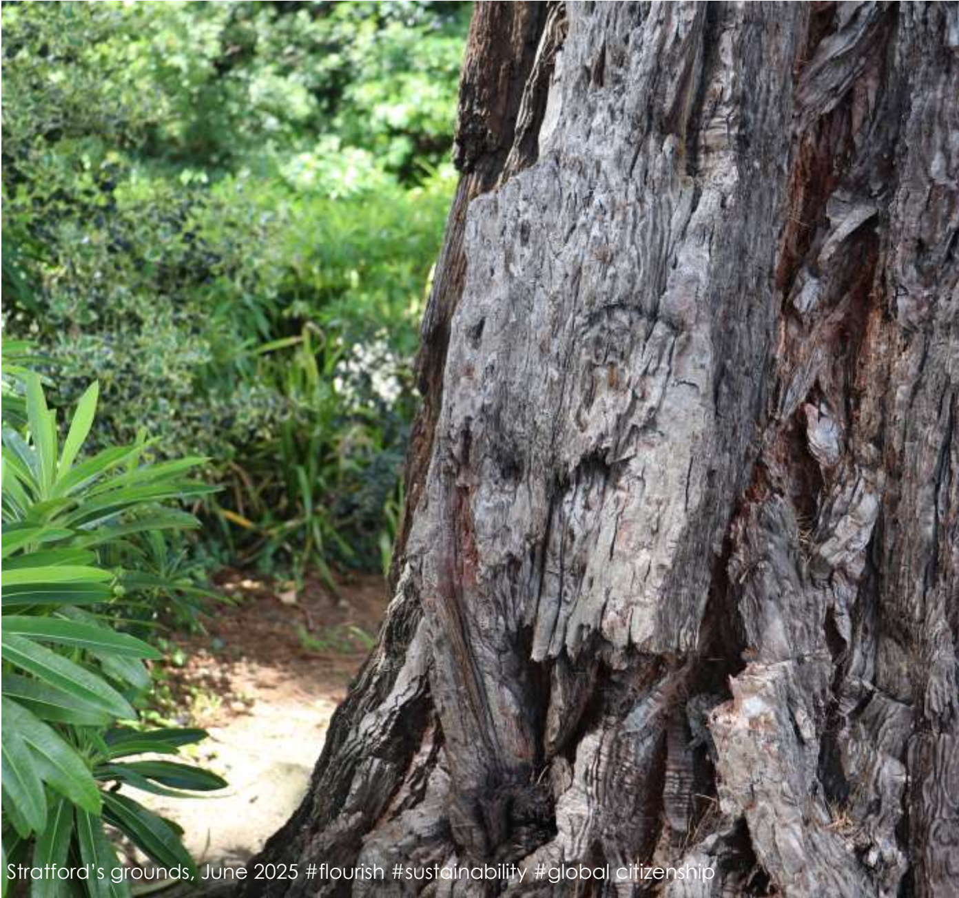
Stratford's grounds, June 2025 #flourish #sustainability #global citizenship