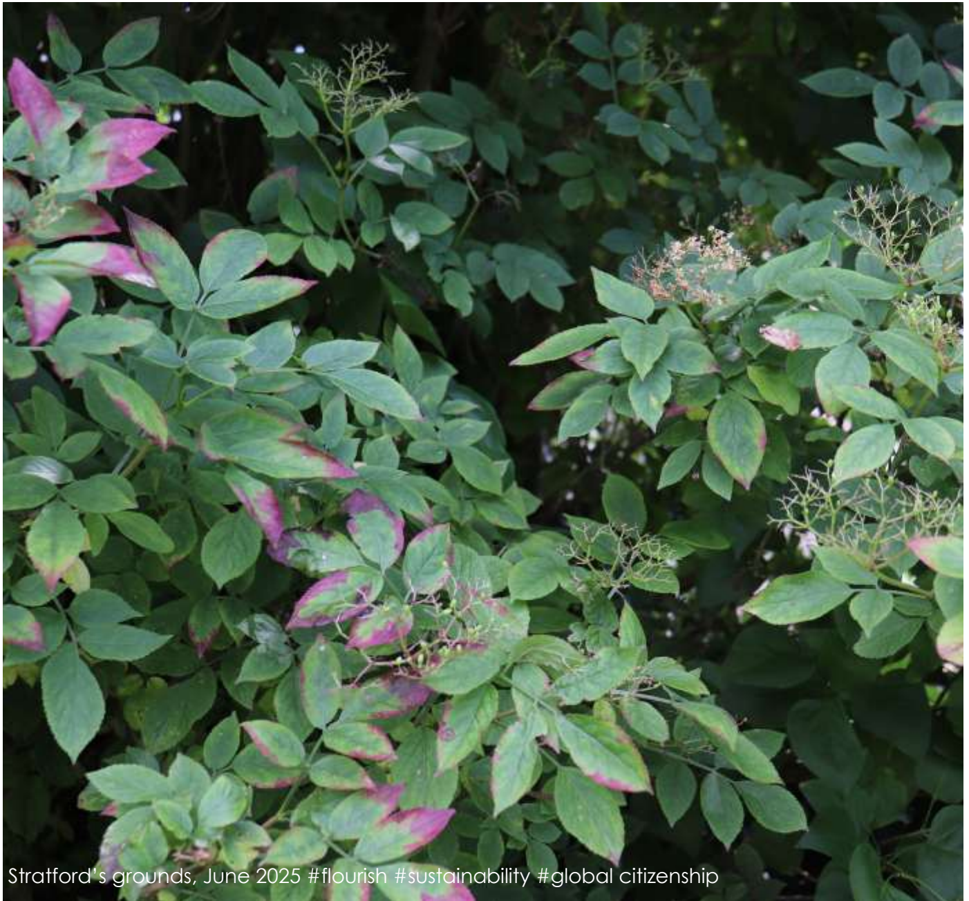
Stratford's grounds, June 2025 #flourish #sustainability #global citizenship