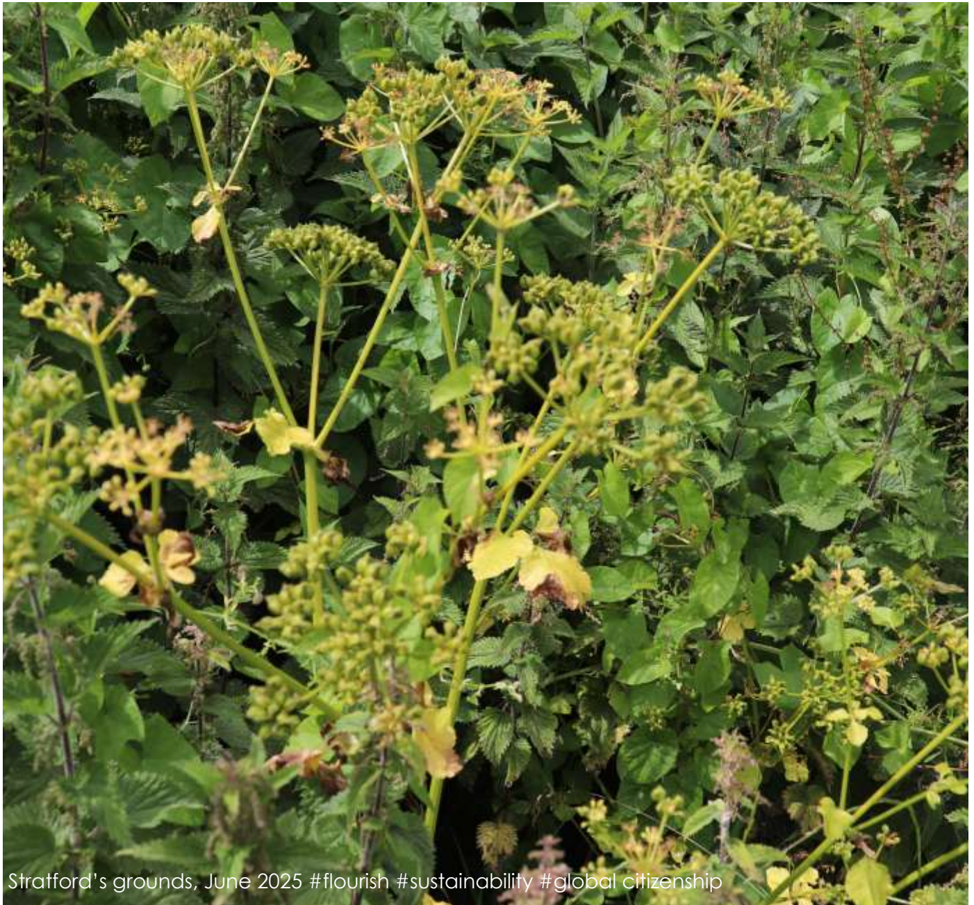
Stratford's grounds, June 2025 #flourish #sustainability #global citizenship