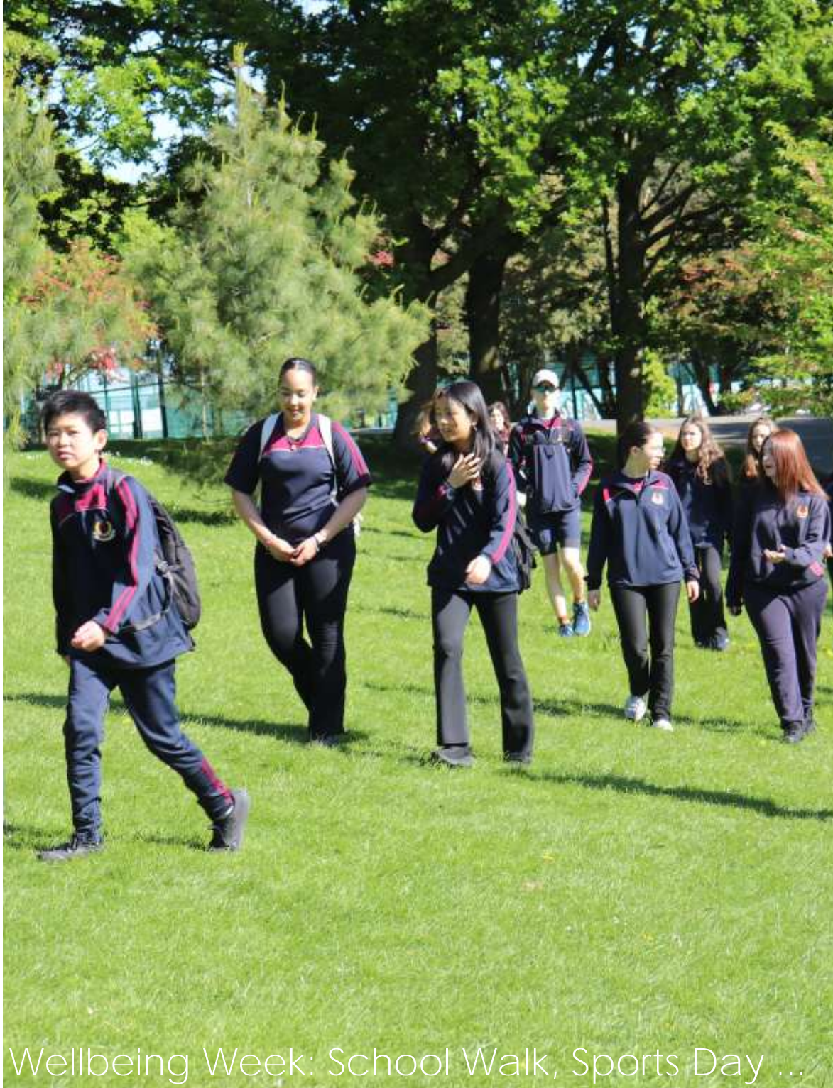
Wellbeing Week: School Walk, Sports Day ...