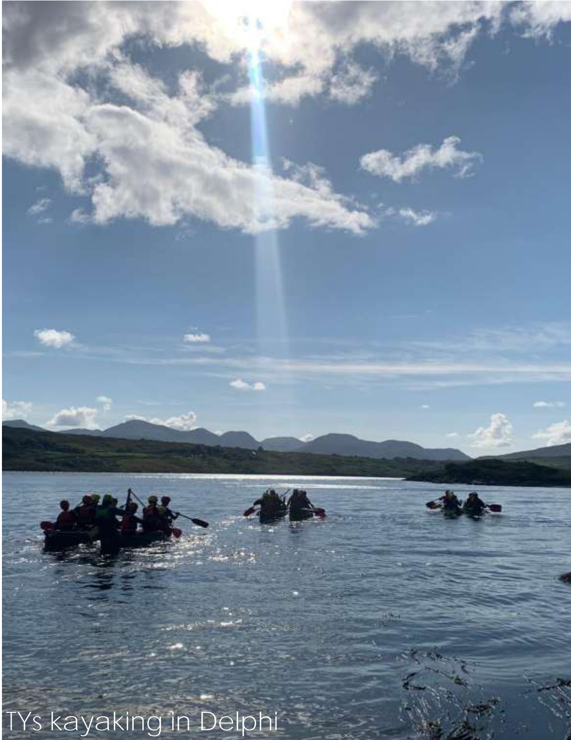
TYs kayaking in Delphi