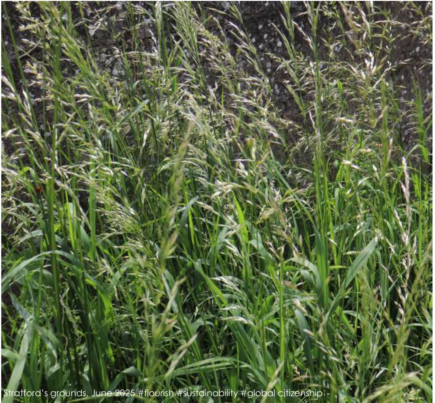
Stratford's grounds, June 2025 #flourish #sustainability #global citizenship