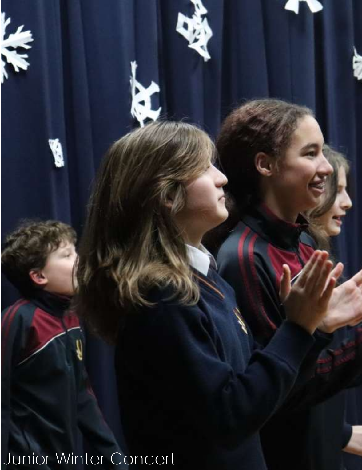
Junior Winter Concert