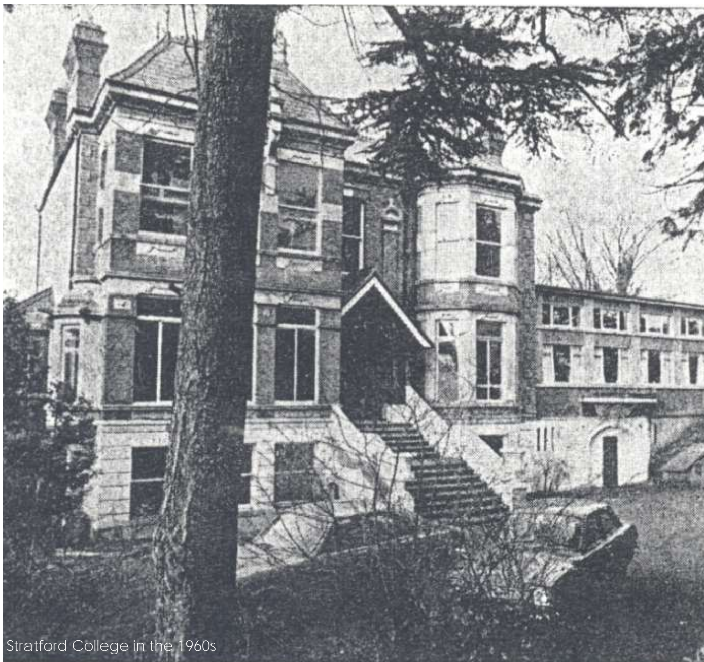
Stratford College in the 1960s