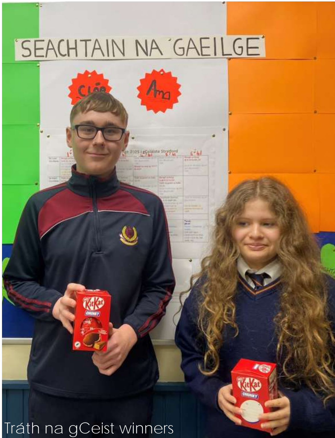
Tráth na gCeist winners