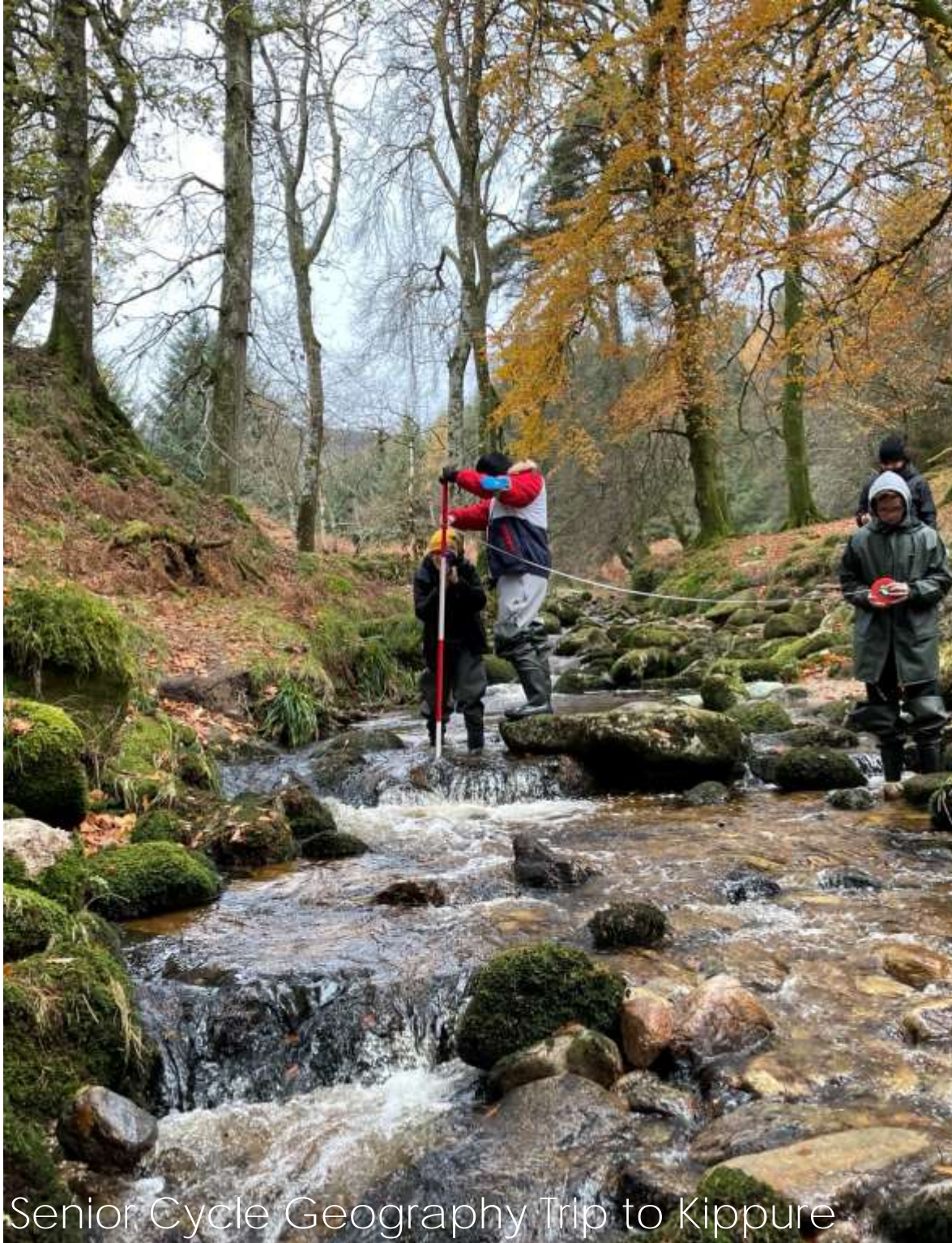
Senior Cycle Geography Trip to Kippure