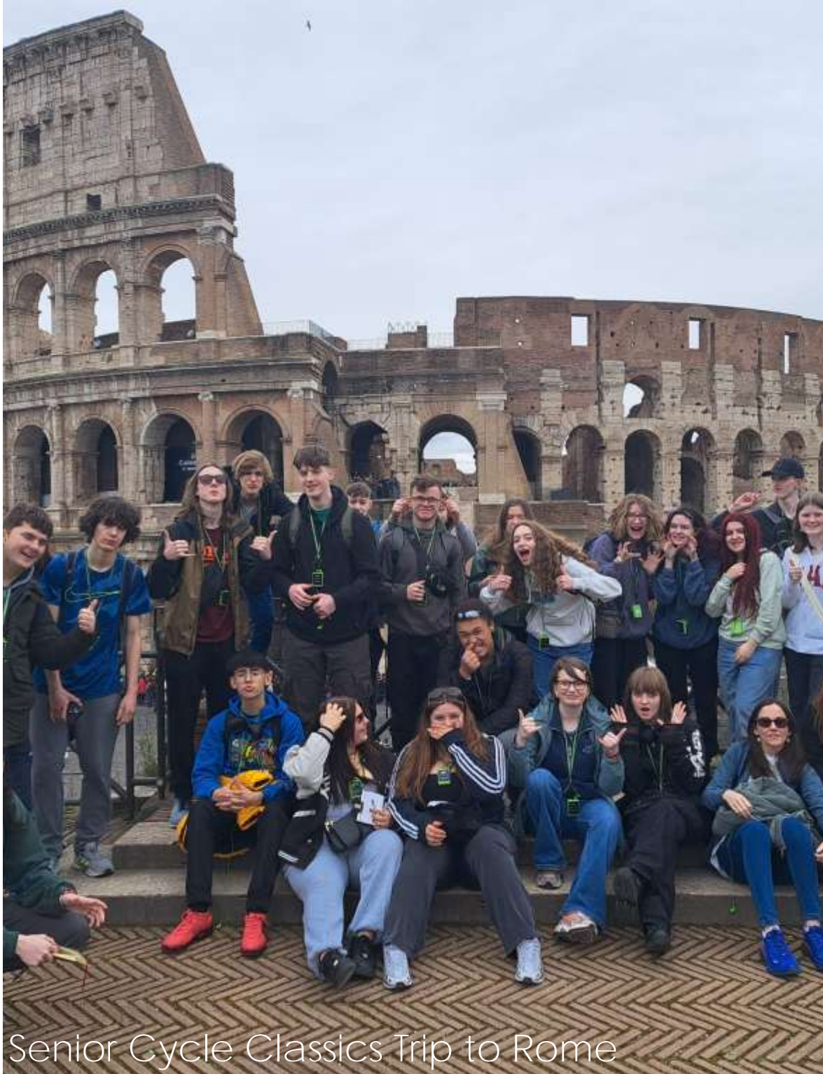
Senior Cycle Classics Trip to Rome