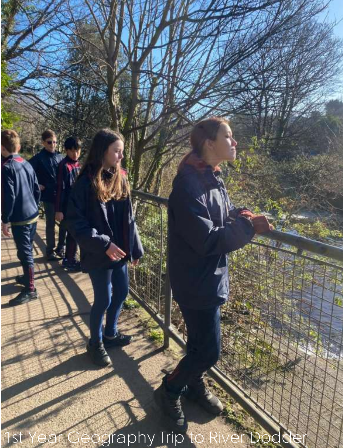
1st Year Geography Trip to River Dodder