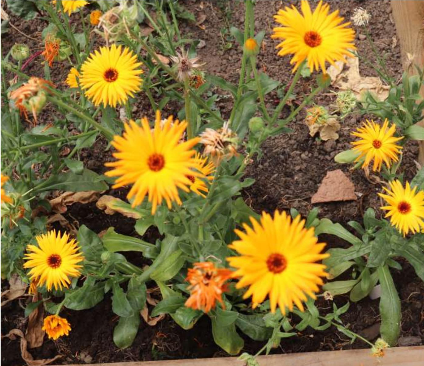
Stratford's grounds, June 2025 #flourish #sustainability #global citizenship