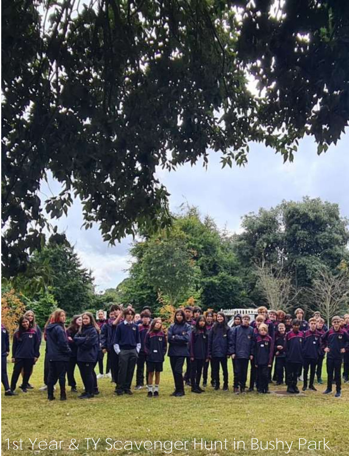
1st Year & TY Scavenger Hunt in Bushy Park