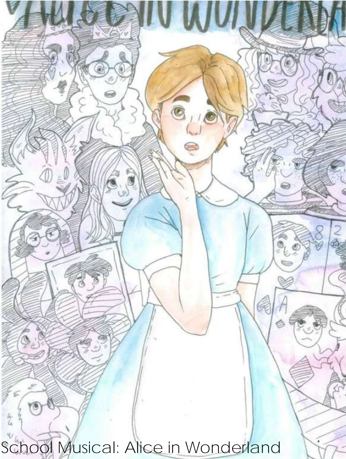
School Musical: Alice in Wonderland