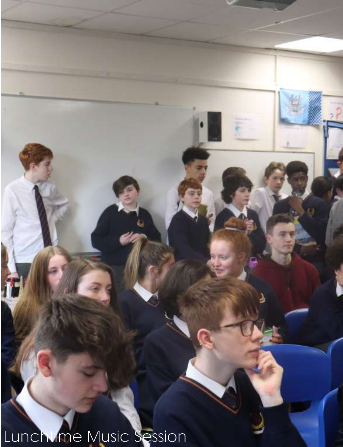
Lunchtime Music Session