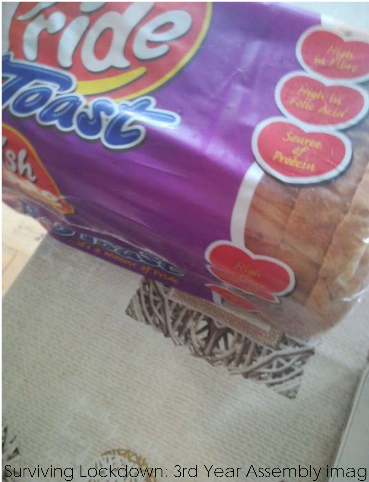
Surviving Lockdown: 3rd Year Assembly image