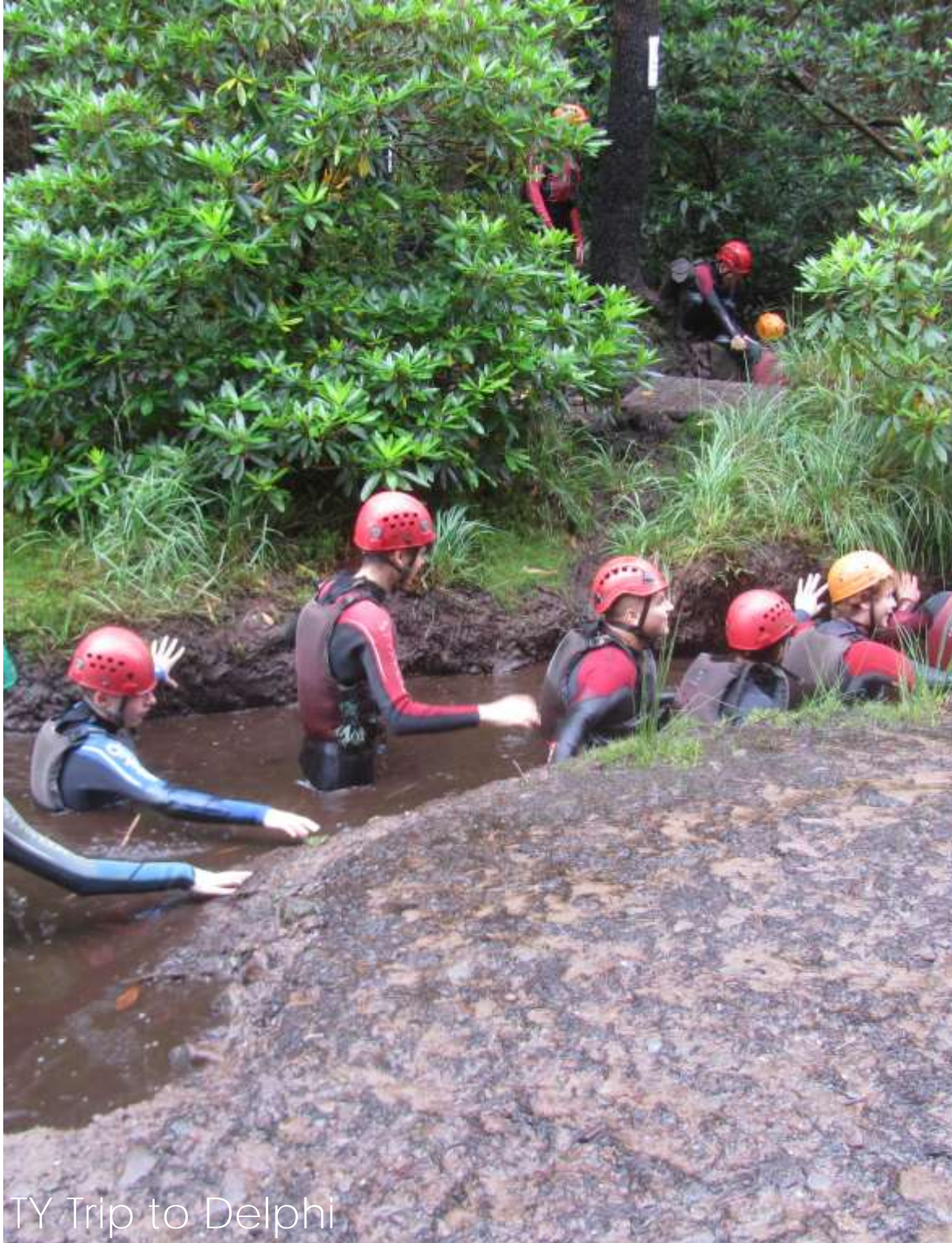
TY Trip to Delphi