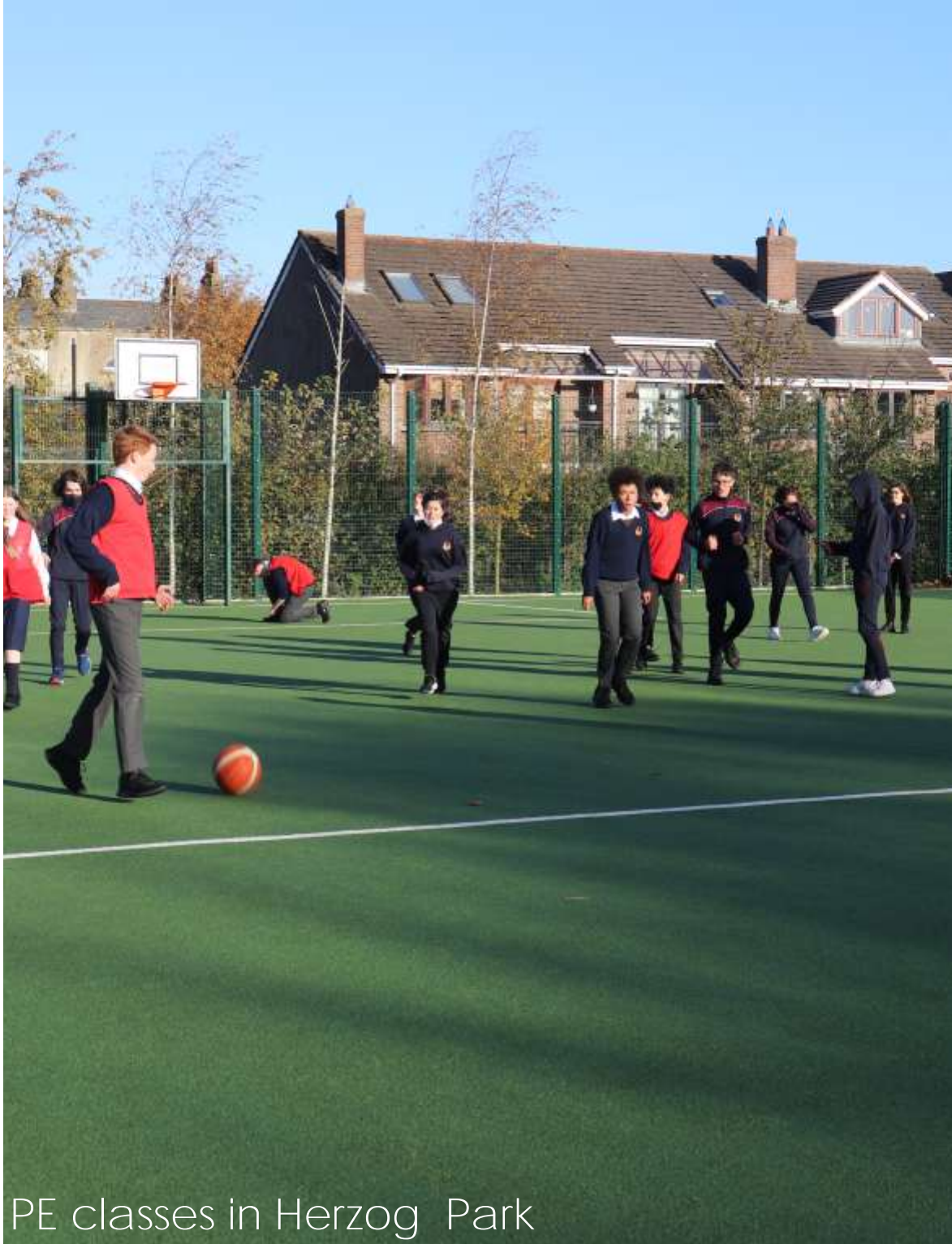
PE classes in Herzog Park