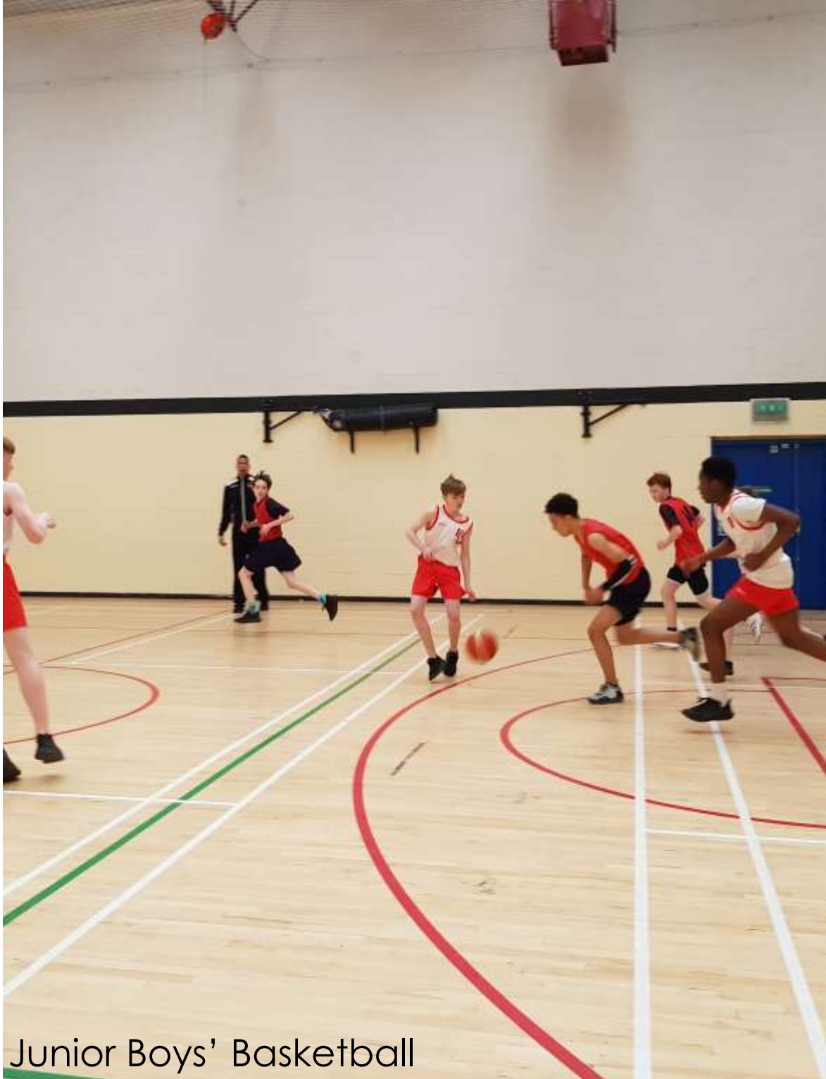
Junior Boys' Basketball