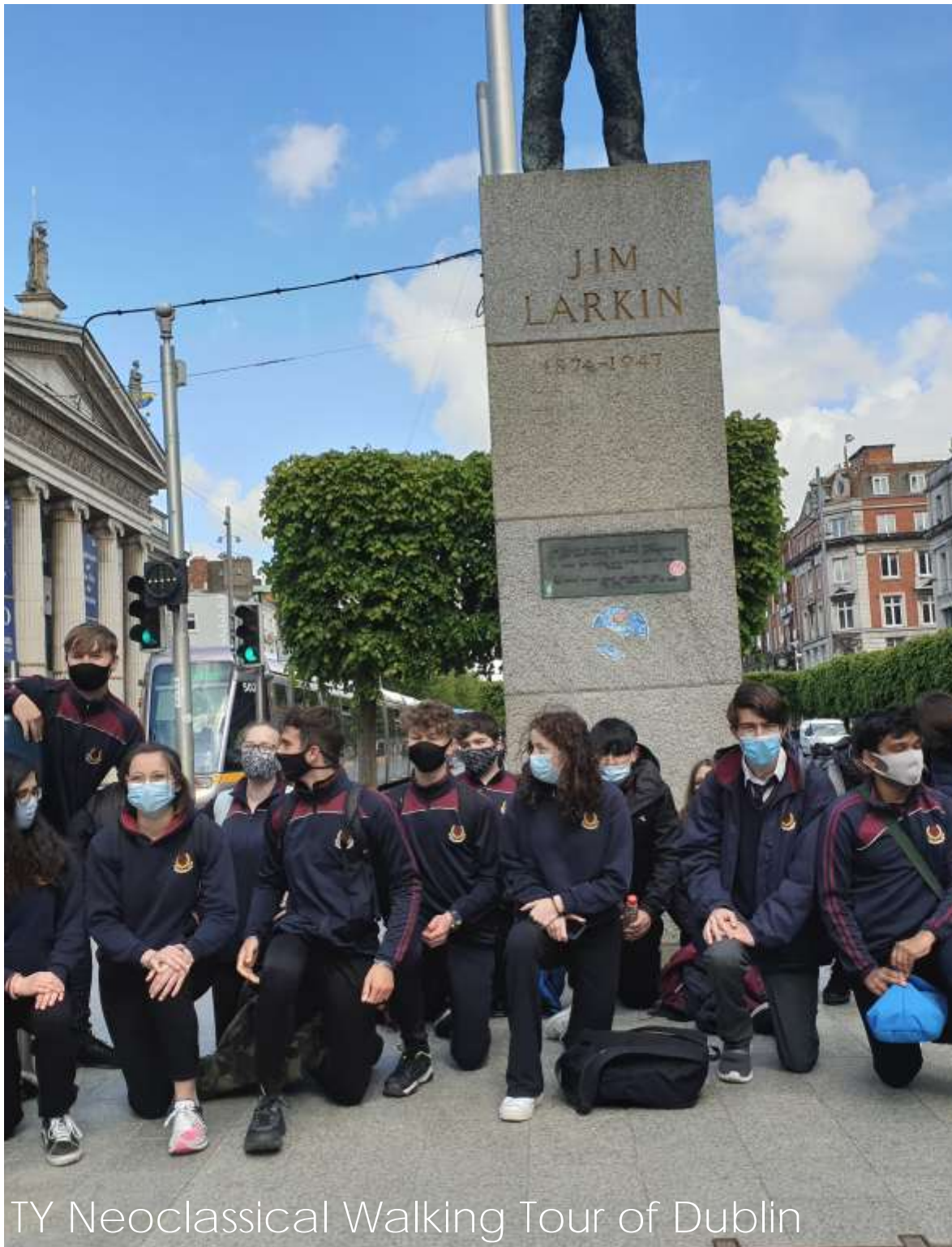
TY Neoclassical Walking Tour of Dublin