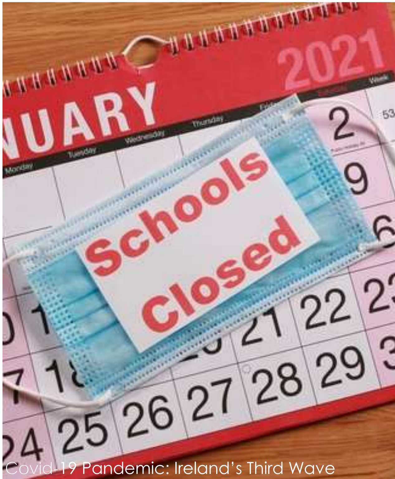
Covid-19 Pandemic: Ireland's Third Wave