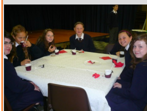
Some 1st year girls tucking in!