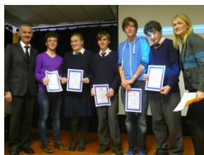
Debating Society Prize-winners