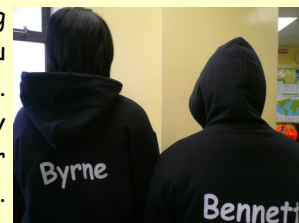
Your own personalised hoodies

Want a cool hoodie? With your name on it? For our TY mini company we'll be selling personalised hoodies. Over the coming weeks we will be going around to classes, asking what you would like printed on your hoodies. We will also be selling specially designed t-shirts for Battle of the Bands in March 2011. Details about the t-shirts to come. We will be selling the hoodies for €18. They will be available in small, medium and large sizes. Get one ☺.