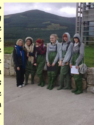
5th and 6th Year Geography students

On the 18th October, the 5th and 6th Year Geography students went to Enniskerry. This was part of our Geographical Investigation which is worth 20% of our final grade in the Leaving Cert. Here we studied both the upper and lower course of the River Dargle. It was a very active day in which we measured the velocity and cross sectional area of each course using various equipment. It took place in the ECO Adventure Ireland Youth Hostel and was located amongst some of Ireland's most beautiful scenery. It was thoroughly enjoyed by all students and we are now looking forward to receiving our full 20% before we sit our Leaving Cert. this summer.