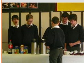
TY boys serving drinks