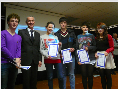
Leadership Awards: Mentors