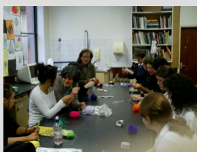
TY Knitting Master class