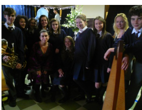
Student musicians and singers