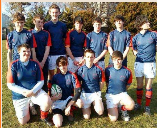
Senior Boys' rugby team

Well done to all the boys involved in senior rugby. All their hard training will be put to the test with a 7's tournament on the 25th March in the High School.