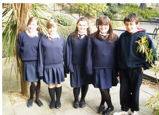
Endeavour award-winning mini-company 'Just a Little Treat'