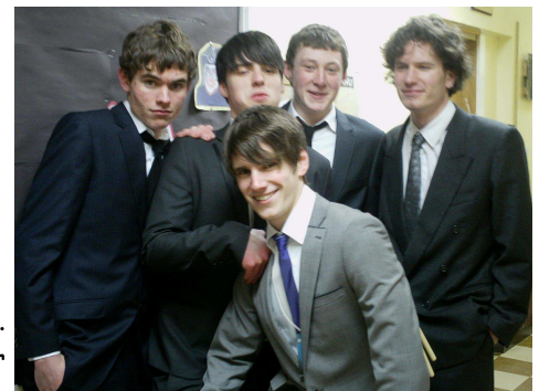
5 th Year group 'Hello Tasty' backstage at the Battle of the Bands