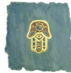
Bottom Floor Exhibition works relating to Jewish themes can be found on the bottom floor, on the wall across from the 6 th Year classroom, with some student works and symbols.

A display of posters and other Jewish works can be found in the reading room, off the Library.