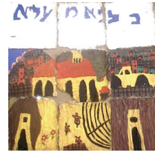
Main Hall Student Council Art Competition

The portraits have a particular relevance to the Jubilee celebrations of Stratford College, in that they enable the students of today to reflect on the present and the students of tomorrow to reflect on the past.