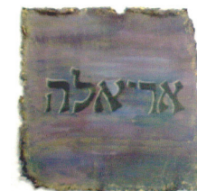
Art Room A selection of student work from all years (excluding 3 rd ) is on display in the Art room.

A display of posters and other Jewish works can be found in the reading room, off the Library.