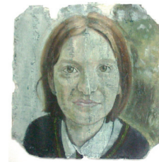
Middle Floor The Centrepiece of the exhibition: Portraits of Students of Stratford College