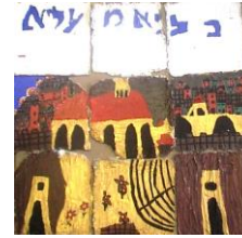
Main Hall Student Council Art Competition

The portraits have a particular relevance to the Jubilee celebrations of Stratford College, in that they enable the students of today to reflect on the present and the students of tomorrow to reflect on the past.