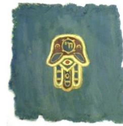
Bottom Floor Exhibition works relating to Jewish themes can be found on the bottom floor, on the wall across from the 6 th Year classroom, with some student works and symbols.

A display of posters and other Jewish works can be found in the reading room, off the Library.