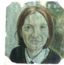
Middle Floor The Centrepiece of the exhibition: Portraits of Students of Stratford College