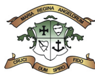
Loreto College Foxrock