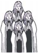
Firhouse Community College