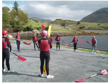
Stratford students learning to paddle.

I was extremely happy to see students put themselves outside their comfort zones and try new exciting activities. Some of the activities were rock climbing, abseiling, Jacobs Ladder, archery, team challenges, zip wire, kayaking and pier jumping. There were some great leadership qualities demonstrated